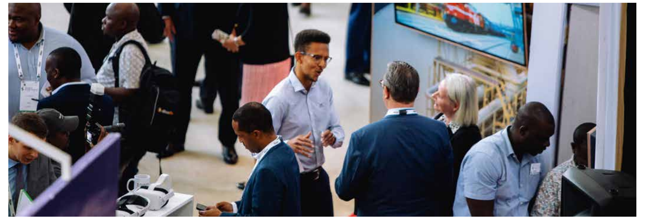
\mbox{\ensuremath{\,^\star}} Strictly reserved for companies Headquartered in Tanzania